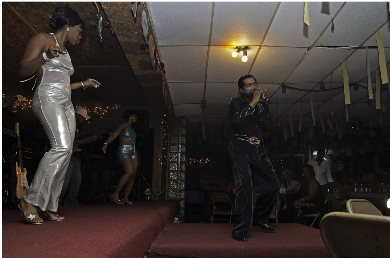
Bobby Rush (right)

I AM THE BLUES takes the audience on the musical journey, visiting with the last original blues artists.